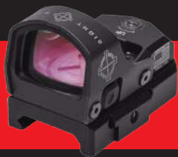
MINI SHOT M-SPEC REFLEX SIGHT