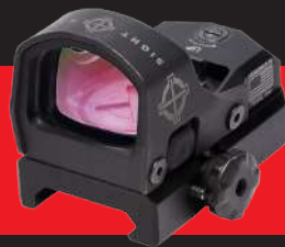
MINI SHOT M-SPEC LQD REFLEX SIGHT