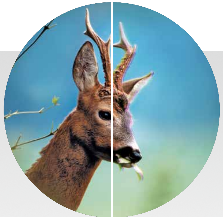
USING HD OPTICS A unique optical system combined with fluoride-containing lenses