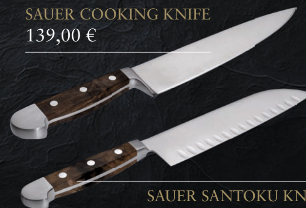
SAUER SANTOKU KNIFE 169,00 €