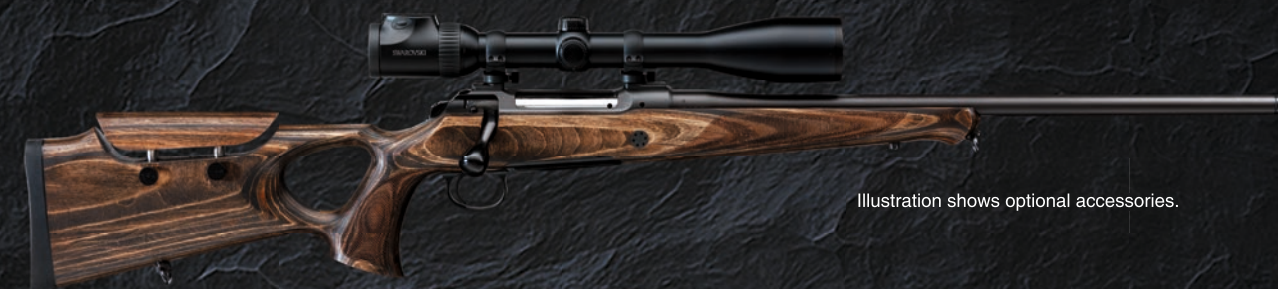
Illustration shows optional accessories.

The S 101 GTI is the ergonomic king of its class. The adjustable comb is the feature that will guarantee a relaxed shooting position and perfect hits. The eye-to-scope alignment cannot be bettered, and the trigger reach is perfect. To top it all off, the S 101 GTI comes with a threaded barrel, detachable sling swivels and a bipod adapter.