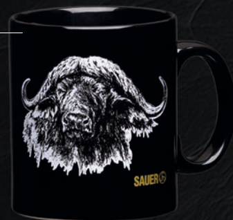
XXL MUG „USE ENOUGH GUN“ 12,99 €