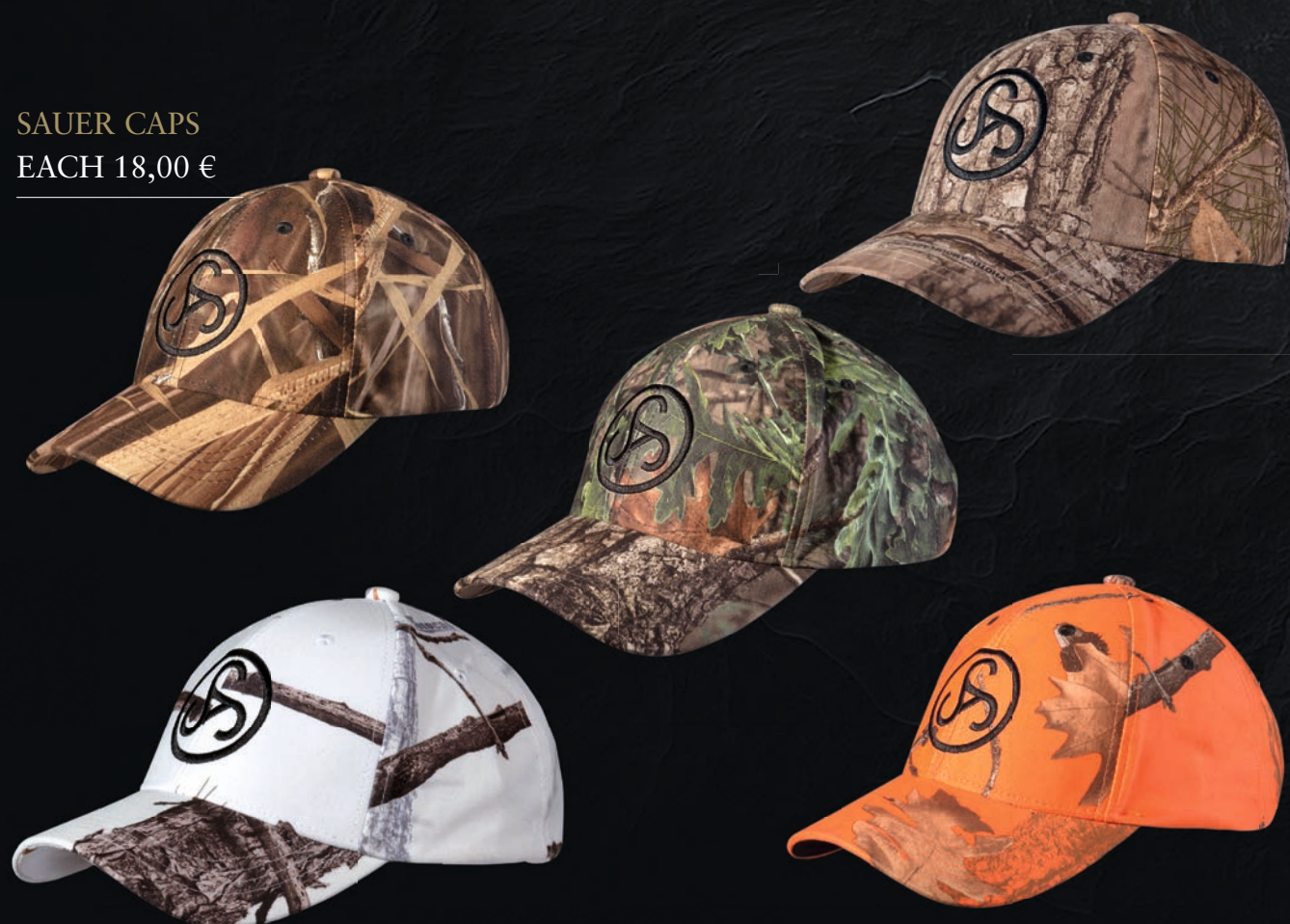
SAUER CAPS EACH 18,00 €