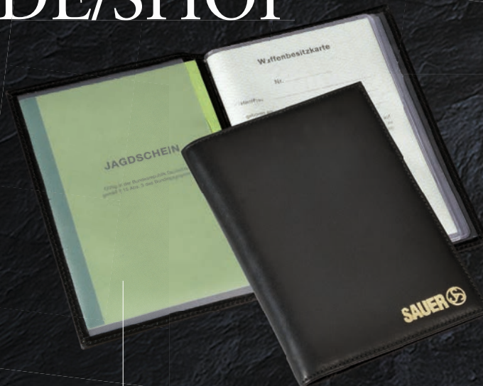
SAUER HUNTING LICENCE LEATHER WALLET 49,00 €