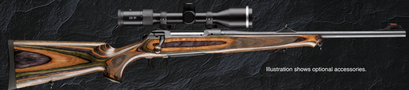
Illustration shows optional accessories.

Born out of the demands of Finnish elk-dog handlers, the S 101 Scandic is unlike any other rifle. It unites practicality, accuracy and a naturally rugged and ultra-stable laminated stock in the perfect "Tundra Green" camouflage color. Removable sling-swivels and an extra swivel socket in the butt of the rifle mean the Scandic can be carried comfortably across your back.