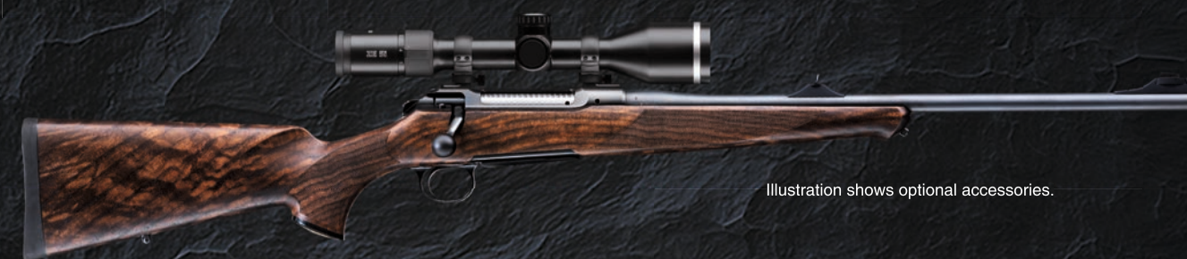
Illustration shows optional accessories.

The Select is tailored for all those who expect more from their hunting rifle than just performance. The flagship of the 101 series thrills not only with superior technology but also with its massive metal bolt knob, painstakingly executed jeweling and revolutionary Laserline stock grain pattern that offers the discreet illusion of natural beauty.