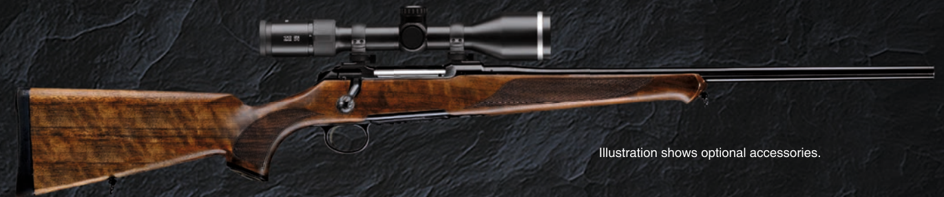
Illustration shows optional accessories.

The Sauer 101 series would not be complete without a Classic. The best traditions of timeless hunting rifles from the house of Sauer & Sohn is reflected in the Classic's slender lines and elegant Schnabel fore-end. The robust stock, made of deluxe walnut with a traditional oil finish, has non-slip chequering ensuring that the S 101 will always be in your control.