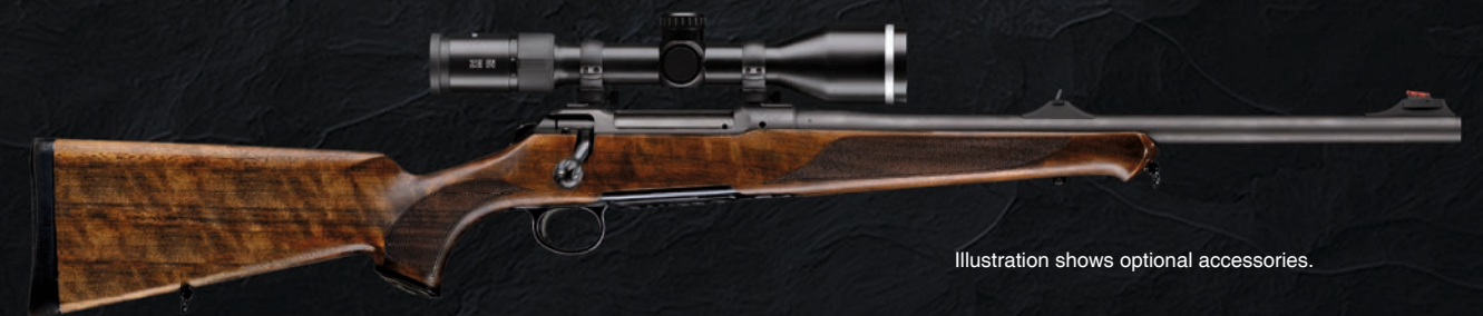
Illustration shows optional accessories.

Whether you are waiting in a cramped blind overlooking bait, or you've drawn the "king's peg" on a driven day, the S 101 Forest combines superior technology, compact dimensions and a lively balance in a hunting rifle that is aimed at one thing: boar hunting! Lightning fast to the shoulder, steady follow-through, focussed target acquisition and the perfect trigger: these are what ensures you'll get those instinctive hits with the Forest.