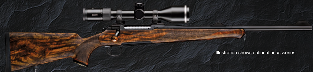
Illustration shows optional accessories.

Standard-cut stocks were yesterday's solution! Now there is the S 101 Artemis, the first premium rifle in the world designed for the huntress, or for those who are of a smaller build. At 98 cm (38.6 cm) long and weighing just 2.9 kg (6.4 lb), the Artemis has taken into account every aspect, making this the optimum hunting tool for those of a smaller frame. Finally Diana, as well as her sons and daughters, has the perfect hunting tool, one that embodies competence rather than compromise.