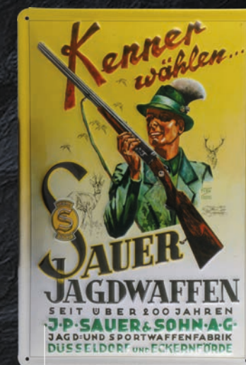
SAUER TIN-PLATE SIGN 19,90 €