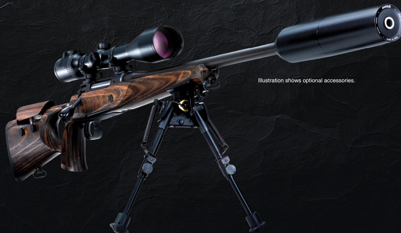
Illustration shows optional accessories.

The S 101 GTI is the ergonomic king of its class. The adjustable comb is the feature that will guarantee a relaxed shooting position and perfect hits. The eye-to-scope alignment cannot be bettered, and the trigger reach is perfect. To top it all off, the S 101 GTI comes with a threaded barrel, detachable sling swivels and a bipod adapter.