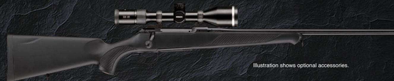
Illustration shows optional accessories.

When you can no longer improve on technology, all that remains is to protect it better. Almost indestructible, the S 101 Classic XT has a black polymer stock that defies all weather and adverse conditions. Thanks to its Soft Touch coating, you also have secure and silent handling. Neither cold, nor wet, nor dirt will interfere with the hunter who uses the Classic XT.