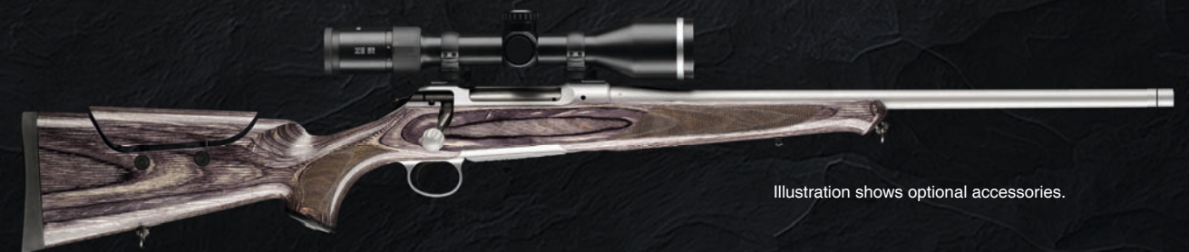
Illustration shows optional accessories.

The S 101 Alaska sets a new standard for extreme rifles in the mid-range market. With its Silver Ilaflon rust protection coating, a high-end laminated stock concept, 56 cm (22 in) Standard barrel and 62 cm (24.4 in) Magnum barrel, both threaded in M 15x1, it represents a new technical achievement. The Alaska's adjustable stock comb give the shooter maximum comfort, thus increasing accuracy.